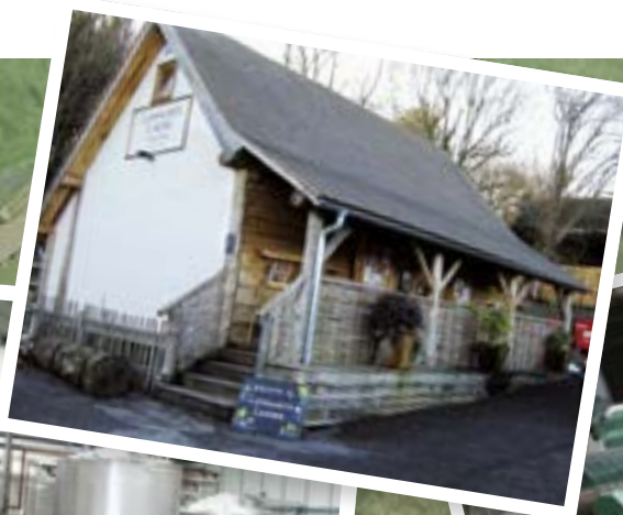
◀ Lodsworth Larder community shop