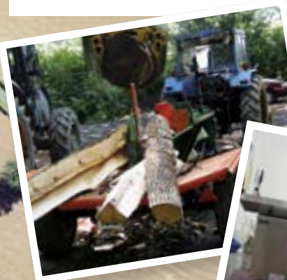
W.P. Duthie Logs & Forestry Services